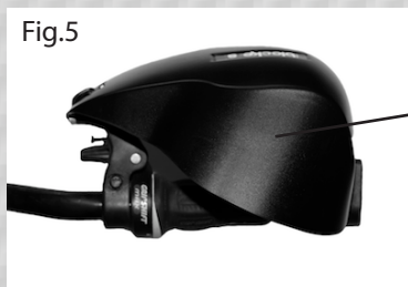
Tornado shield secured with brake horizontal