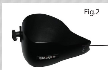
mounting lugs 1 and 2